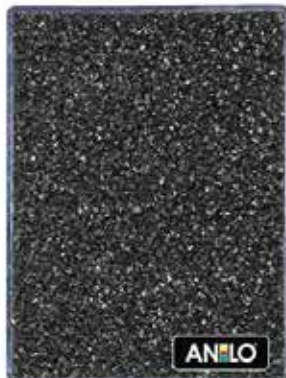
ANL2672 0.8/1.2 mm