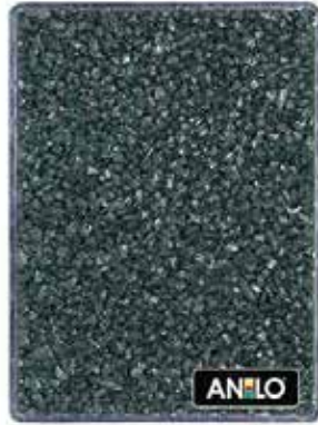
ANL2677 1.5/2.5 mm