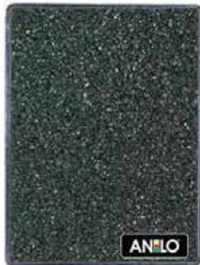
ANL2668 0.8/1.2 mm