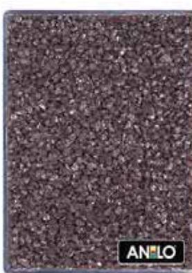
ANL2673 1.5/2.5 mm