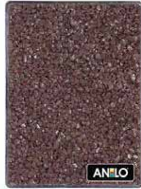
ANL2678 1.5/2.5 mm