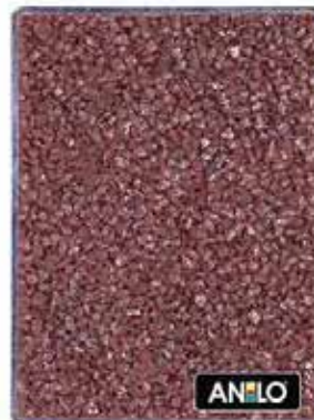
ANL2675 0.8/1.2 mm