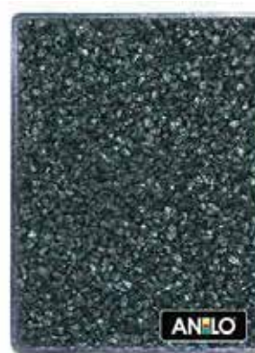
ANL2674 1.5/2.5 mm