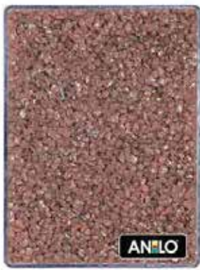
ANL2680 1.5/2.5 mm