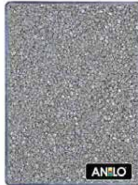
ANL2669 0.8/1.2 mm