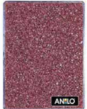
ANL2670 0.8/1.2 mm