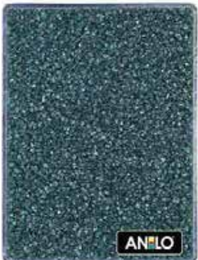
ANL2671 0.8/1.2 mm