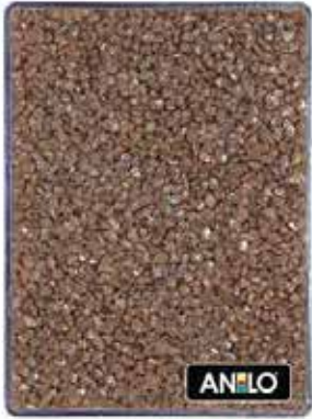
ANL2676 1.5/2.5 mm