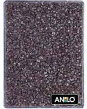
ANL2679 1.5/2.5 mm